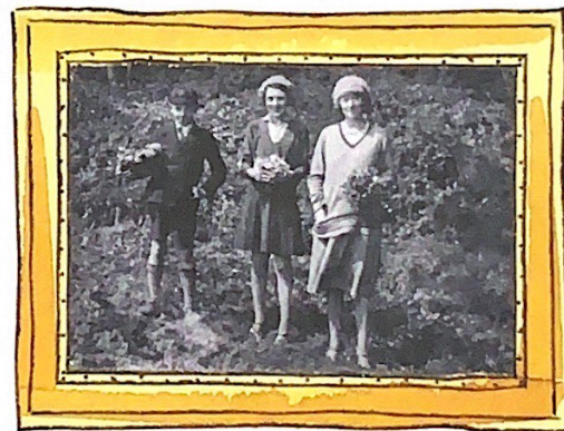
As a boy, with his mother and sister