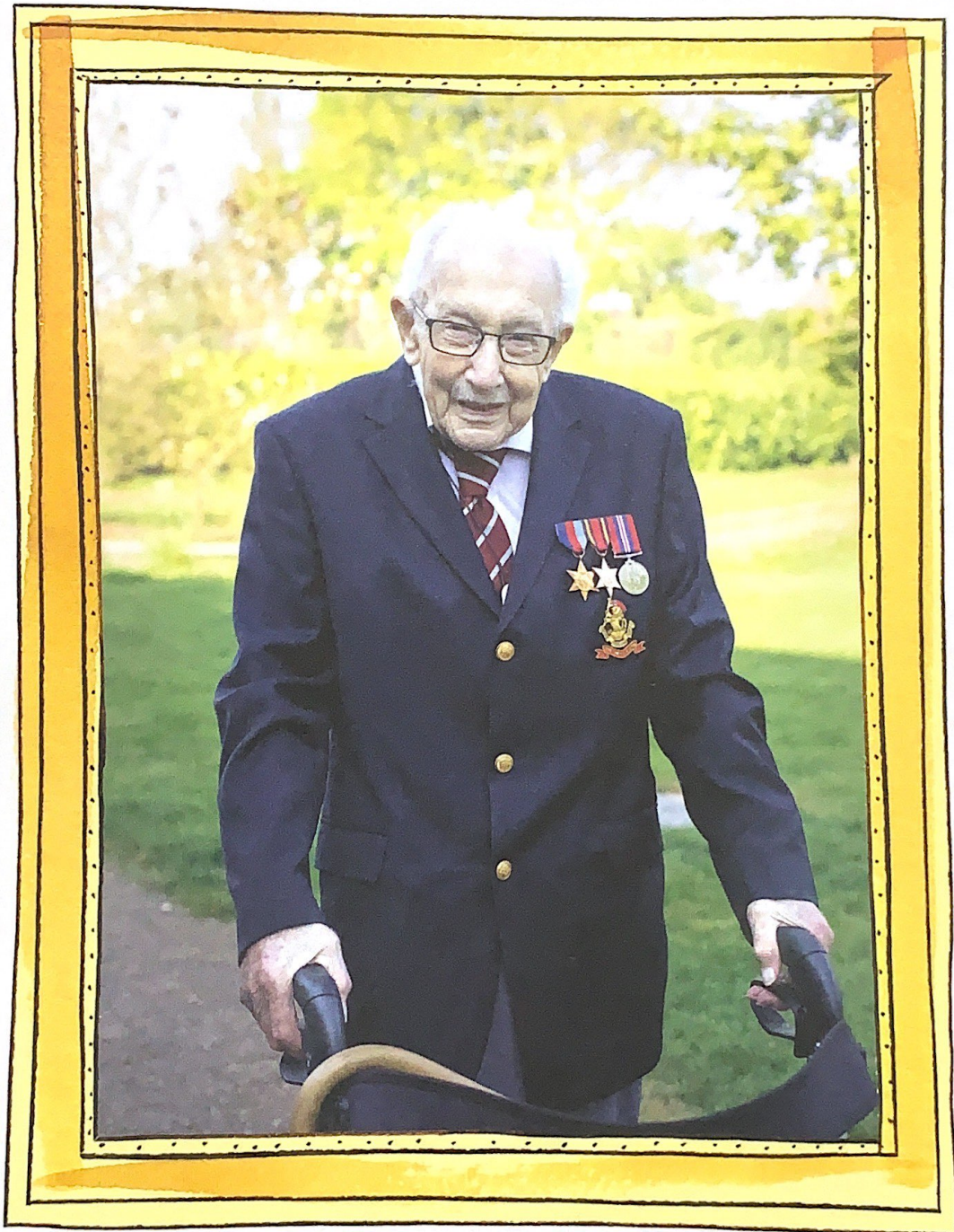
Captain Sir Tom Moore walking for the NHS in 2020

During the coronavirus pandemic in 2020, Tom inspired the nation by walking one hundred laps of his garden in time for his one hundredth birthday, raising nearly £40 million for charity and providing a voice of hope during a dark time. In recognition of his incredible work, he was awarded an honorary promotion to colonel, a knighthood and a gold Blue Peter Badge!