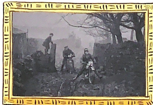
Riding his motorbike